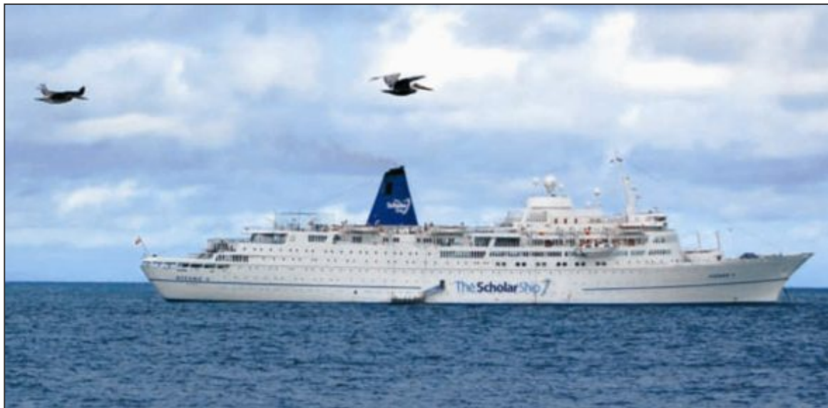
The Scholar Ship, a unique intercultural academic programme, docks in Cape Town on Wednesday

The world's only ocean-based academic program will arrive in Cape Town on Wednesday. More than 200 university students and faculty representing 35 countries will spend six days in the Mother City conducting academic field study, community service and independent travel.