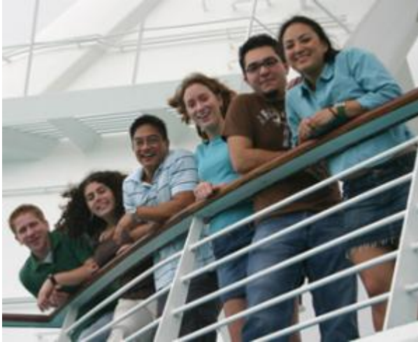
Students on the Scholar Ship

It's the largest and most populous city in Ecuador. And it's the nation's main port on the Pacific.