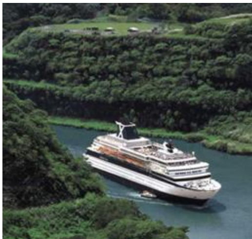
The Scholar Ship

For our Geo Quiz we're tracking a ship. It's a floating university called the Scholar Ship.